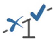
Improve Decision Quality